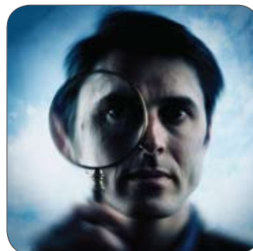
On the Cover

The Philadelphia Bar Foundation's First Andrew Hamilton Ball.