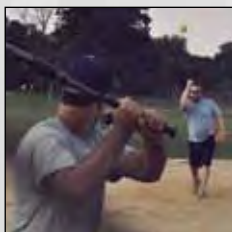
The Barristers of Summer